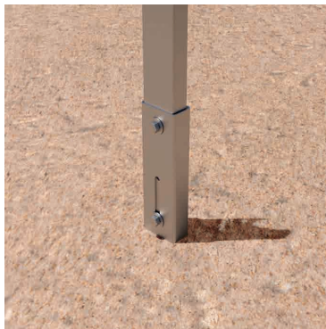
Sistema hincado para suelo