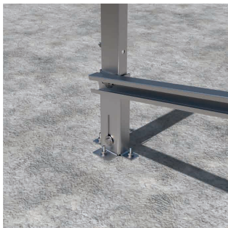
Sistema para la cimentación