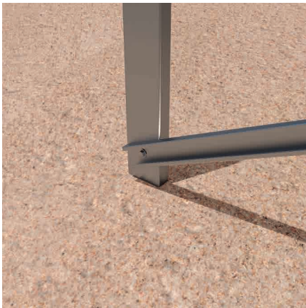
Sistema hincado para el suelo