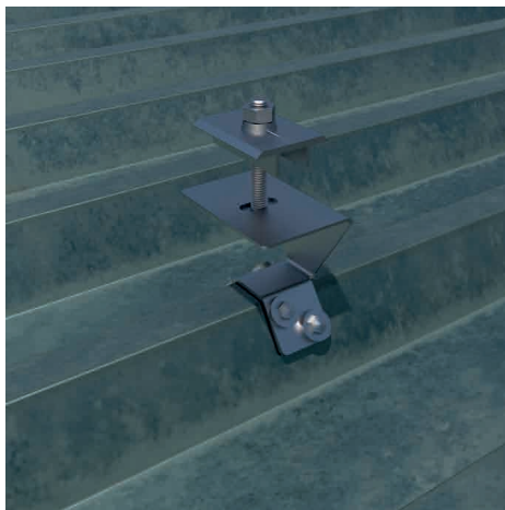
Sistema de fijación directa a greca