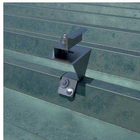
Sistema de fijación directa a greca